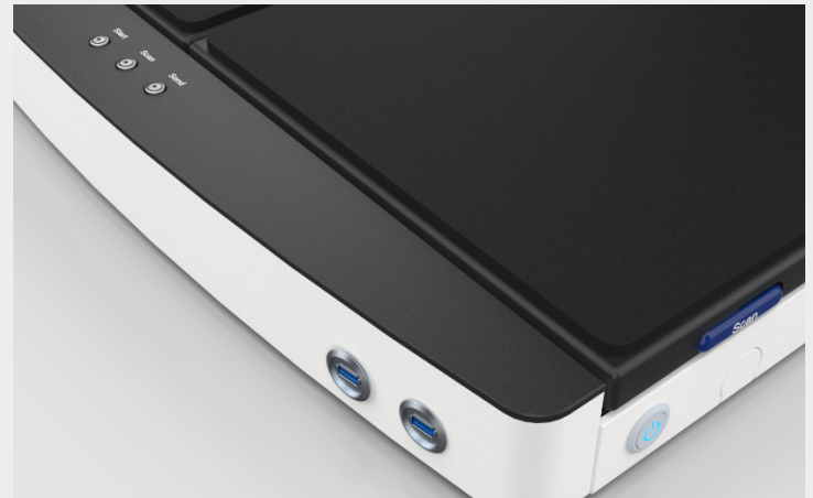
Store images directly to any USB devices via the USB 3.0 ports

Full Coverage Warranty, up to 5 years of free spare parts and consumables.